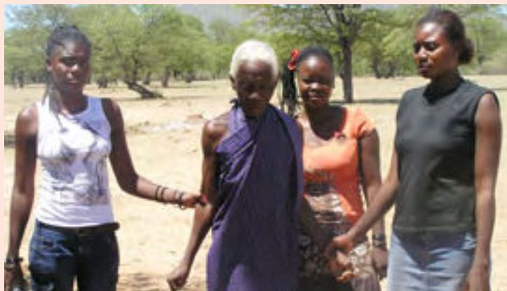
What is Your Name's 20 metre walk to the shady tree was a symbol for me of her first steps to freedom