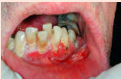
Cancer of the gum and inside of the lip which would have been diagnosed sooner had the patient seen their dentist regularly

The World Health Organisation (WHO) has expressed concern that the oral health of older people is widely neglected. Based on a global survey of older people WHO has called for public health action by strengthening health promotion, integrating disease prevention and improving age-friendly primary oral health care. Exclusion