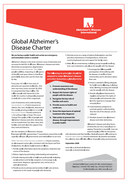
Over 30,000 people worldwide have signed ADI's Global Charter since it was launched in 2008

The 'Facing Dementia: Advancing Care in Europe' forum was set up in 2004, with ADI working alongside Pfizer and Eisai on the project. The aim of the forum was to discover the challenges of dementia on a global scale.