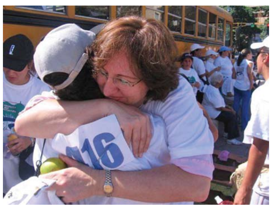
Fundacion Alzheimer de Venezuela organised a laughter workshop, conference and numerous memory walks across the country

Fundacion Alzheimer Aruba marked the day by hosting their first Alzheimer Social Club and launching their website. They also introduced