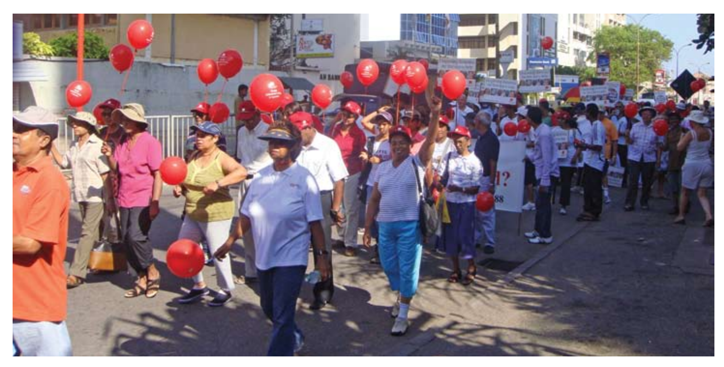
Around 300 people took part in the Lanka Alzheimer's Foundation's Memory Walk, which marked the end of their 12-week campaign

awareness. In Hungary, hundreds of children from Budapest were invited to join the 'Memory Bridge', holding hands in a 'Live Chain' on the city's famous Chain Bridge.