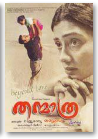
Three recent films about dementia: Away from her, ¿Y tú quién eres? and Thanmatra

industry have released two very high profile films, Black and Thanmatra which have depicted the effect of Alzheimer's disease on the life of an individual and their family and portrayed beautifully the themes of compassion and enduring love.