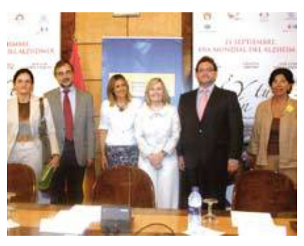
Members of CEAFA, the Alzheimer association in Spain, using the film ¿Y tú quién eres? to promote World Alzheimer's Day 2007

Many associations are distributing these films as part