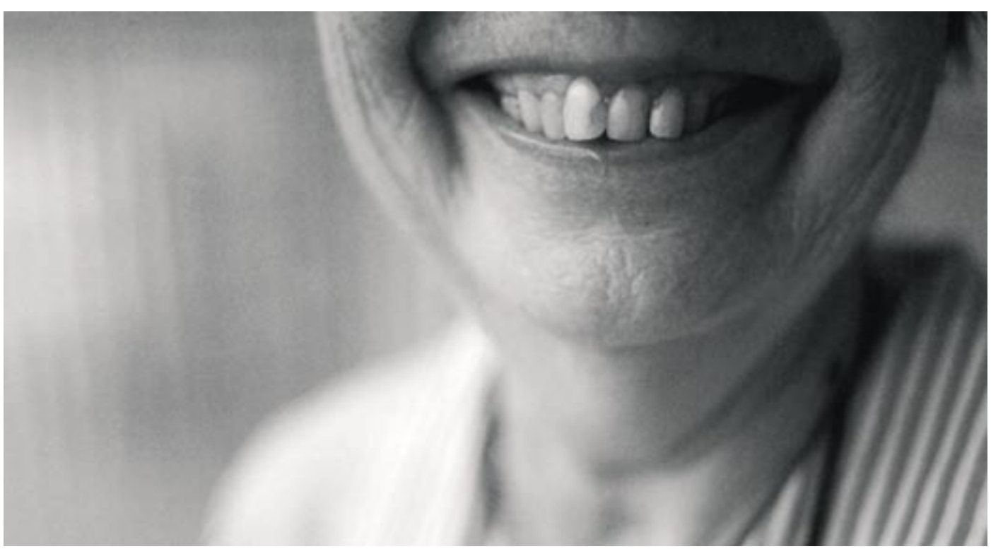
Photography competition winners