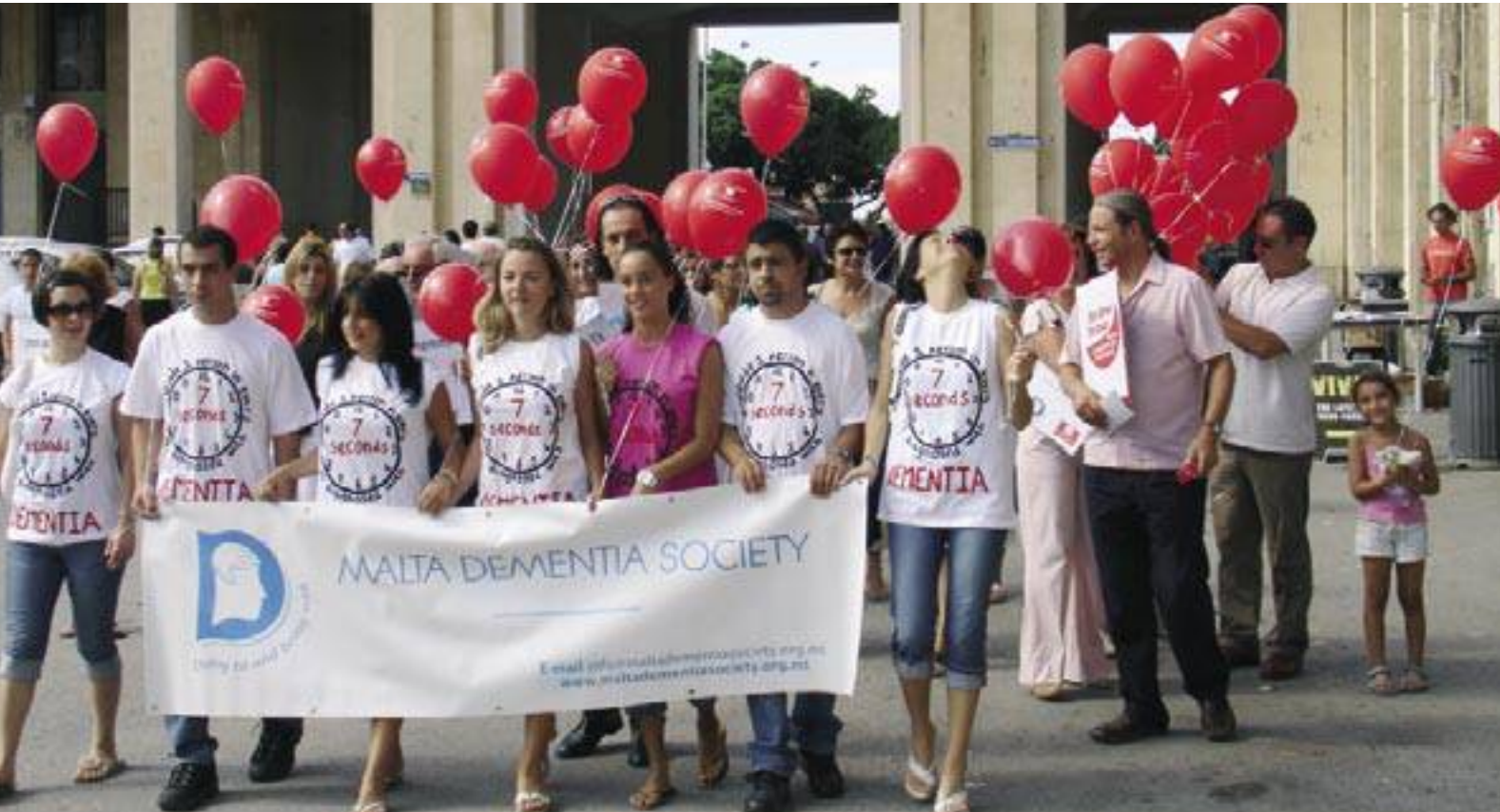
Malta's Memory Walk

more recognition of a condition that currently affects his mother (see page 3). The media picked up the story all over the world and ADI received clippings and photos from associations worldwide united under the 'No Time to Lose!' theme, demanding more attention and