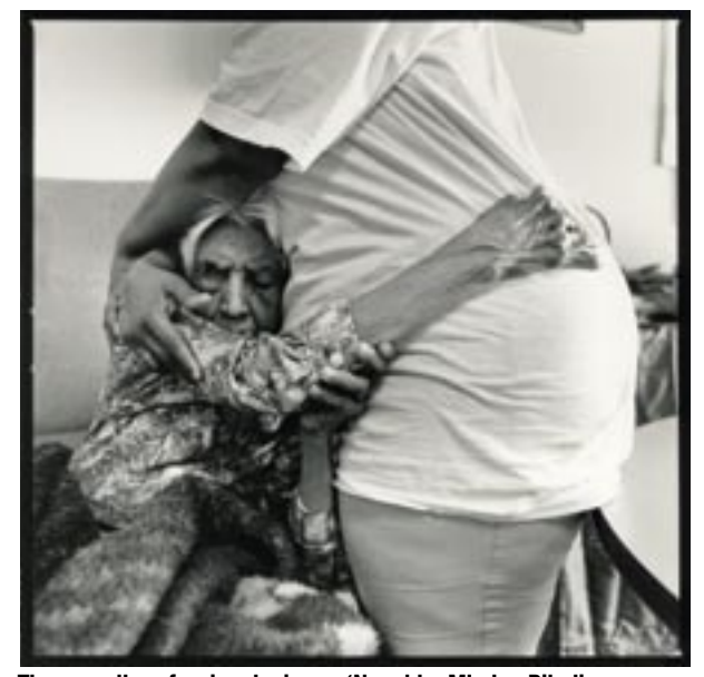
The overall professional winner: 'Nany' by Mladen Pikulic