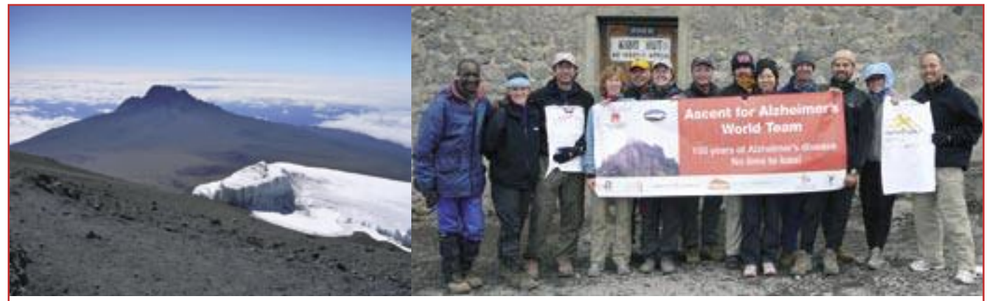
The view from the summit