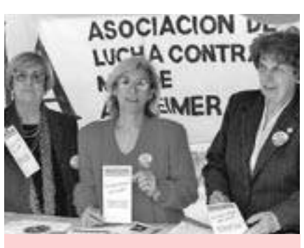
Raising awareness on World Alzheimer's Day 2004, Asociación Lucha contra el Mal de Alzheimer, Argentina