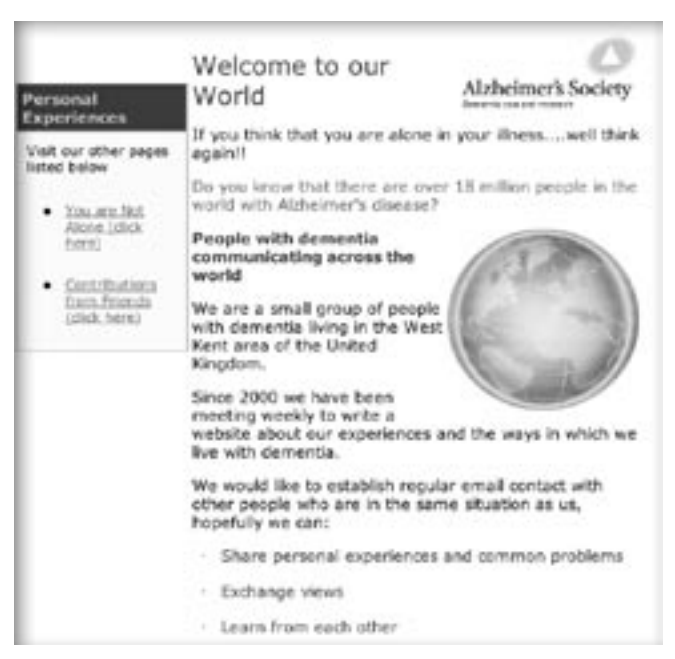
Communicating across the world: the West Kent website

We have support from our local branch of the Alzheimer's Society for technical aspects of putting our material onto the website. Perhaps other local support groups would be willing to establish their own projects to facilitate electronic communication with us by their members. Our weekly meetings are attended by a