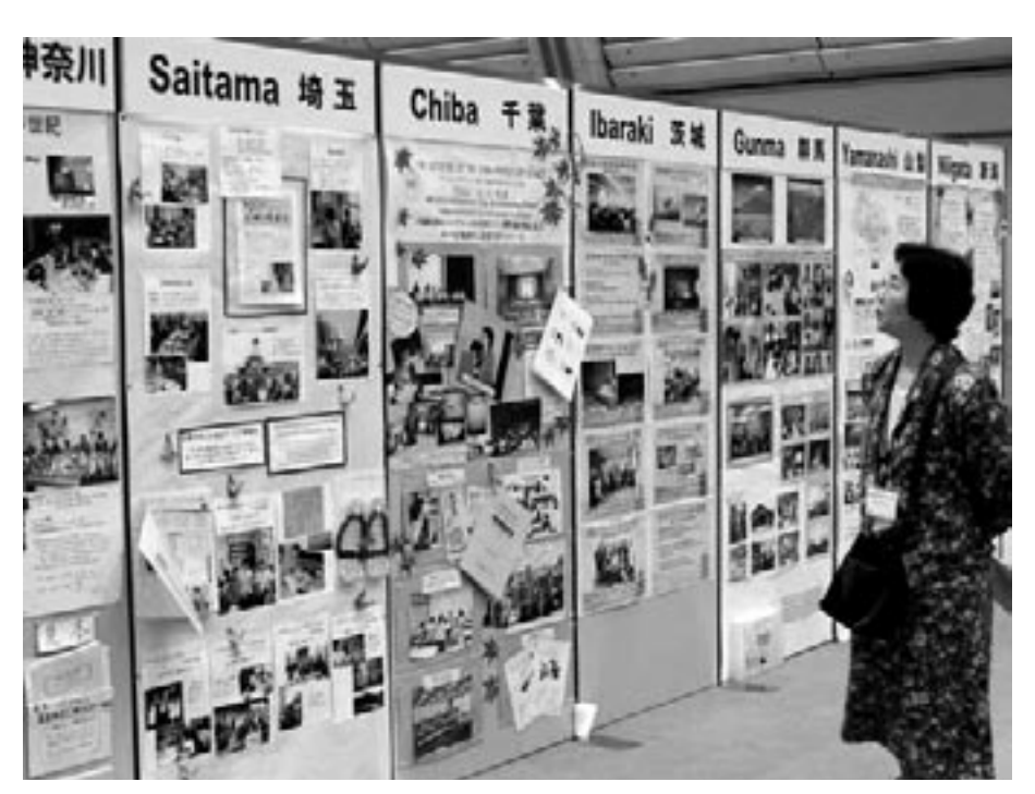
Walk around the world – the exhibition hall featured displays from AAJ's 42 chapters and over 30 associations from around the world \frac{1}{2}