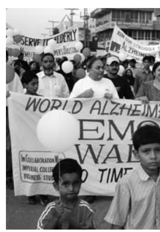
A record 21 Alzheimer associations took their 'No time to lose' campaign to the streets by organising Memory Walks like this one in Pakistan

In Scotland, members of the Scottish Dementia Working Group met with the health minister to