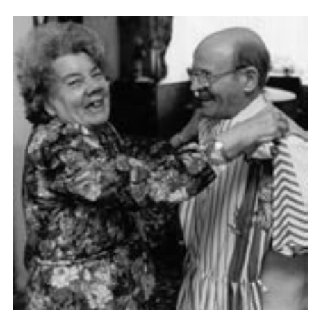
Quality of life is a concept that is rather difficult to define but one that is intuitively understood

The workshops are aimed at improving the quality of life for people with dementia and carers. Their focus is not to develop ways of measuring quality of life but instead to find ways of understanding quality of life in dementia. The rationale for the series came from the need to develop a cross-national understanding of what determines good and bad quality of life in dementia, and what can improve quality of life in dementia, and develop a framework with which to judge services and policy for people with dementia.