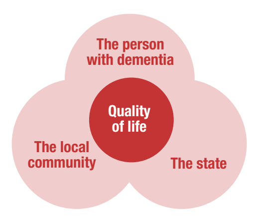
Influences on quality of life