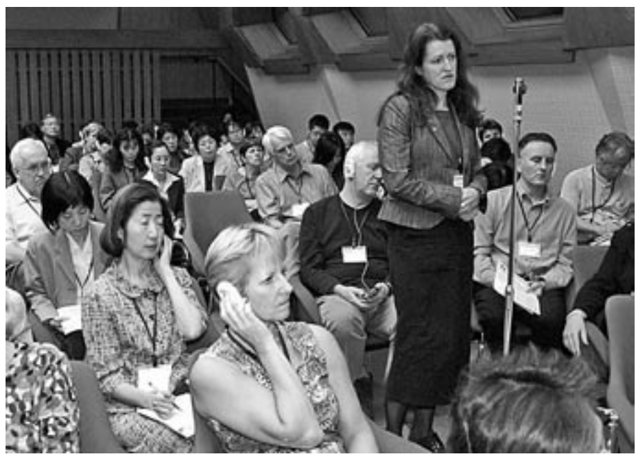
Simultaneous translation at all sessions meant that national and international delegates could share and learn from one another