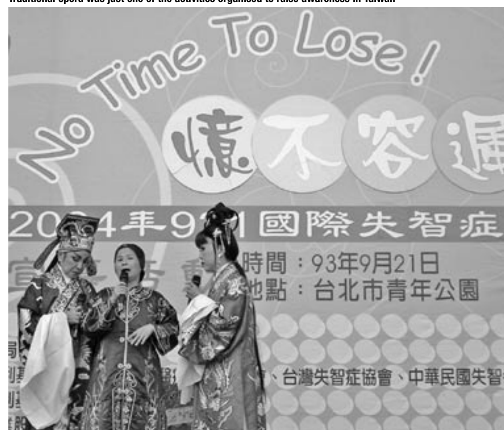
Traditional opera was just one of the activities organised to raise awareness in Taiwan

set off from Europe in March and drove their 45-year-old Land Rover through Turkey, Pakistan and India on their epic fundraising Holland to Himalayas expedition. Visit www. holland2himalayas.co.uk to find out more.