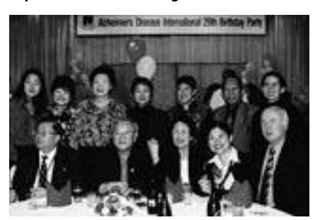
Representatives from Alzheimer associations in the Asia Pacific region celebrate ADI's 20th anniversary