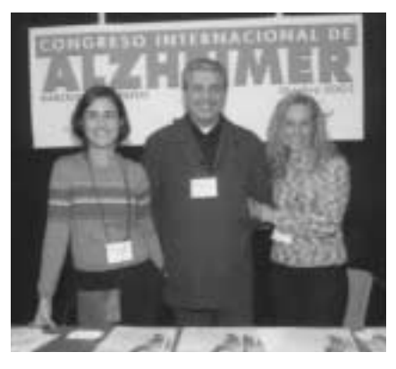
Members of the conference organising committee welcome you to Barcelona

The association receives support for its programmes from the government, Foundations, banks and other companies. These have