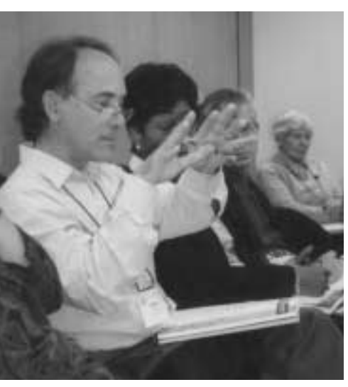
Sharing and learning from one another at the ADI workshops

The ADI showcase provided an opportunity to literally walk your way around the world of dementia by visiting