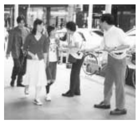
Alzheimer's Association Japan distributed 250,000 leaflets throughout Japan