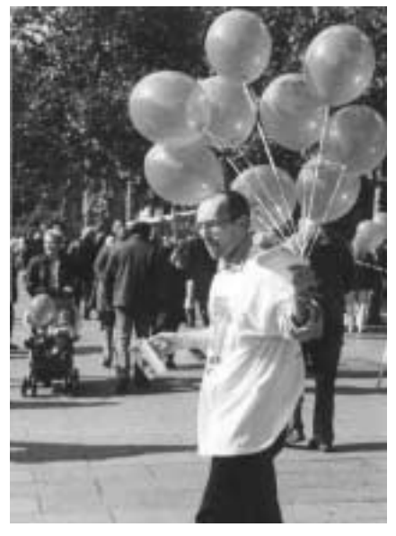
Deutsche Alzheimer Gesellschaft used Memory Walk to raise funds