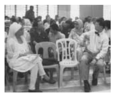
Alzheimer's Disease Foundation Malaysia launched the country's first Memory clinic