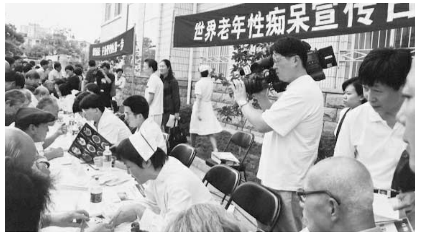
Over 1000 people came for free memory consultations at various hospitals in Beijing, China