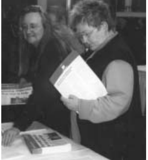
The conference is an important way of introducing people to ADI's work