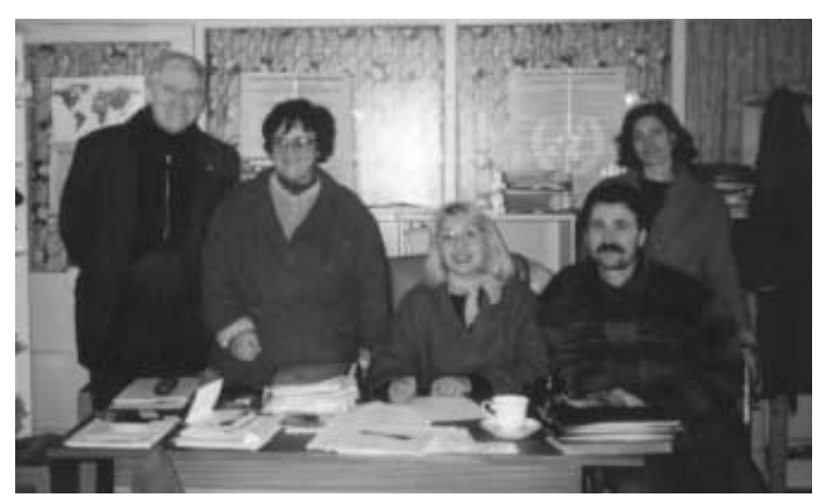
West meeting East gave staff of both associations an understanding of the challenges each other faces: Societatae Romana Alzheimer staff wear house coats in their office because of lack of heating