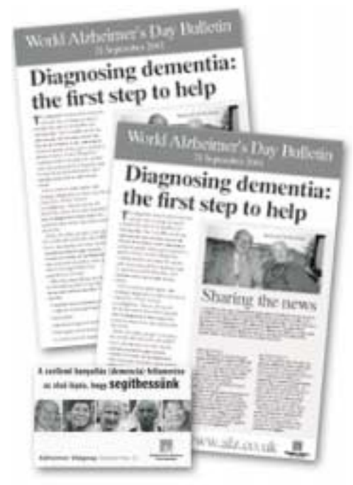
Members are encouraged to translate ADI materials into other languages making them accessible to a wider audience. In addition to English and Spanish materials provided by ADI, the bulletin and postcard were translated externally into Chinese and Hungarian. Other members (Brazil) used text from the official ADI bulletin but incorporated family testaments from their country

Other Alzheimer associations (including Brazil, Pakistan, El Salvador, Cyprus, Indonesia, Scotland, Venezuela, Lithuania, Trinidad and Tobago, Korea, India, Costa Rica) held seminars and