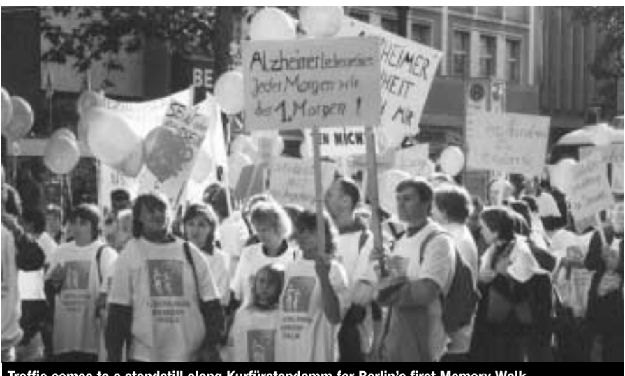
Traffic comes to a standstill along Kurfürstendamm for Berlin's first Memory Walk

World Alzheimer's Day continues to go from strength to strength and over 45 countries commemorated the day on 21 September 2001. For the Alzheimer associations of China and Hungary, this was the first year that World Alzheimer's Day was observed in their country.