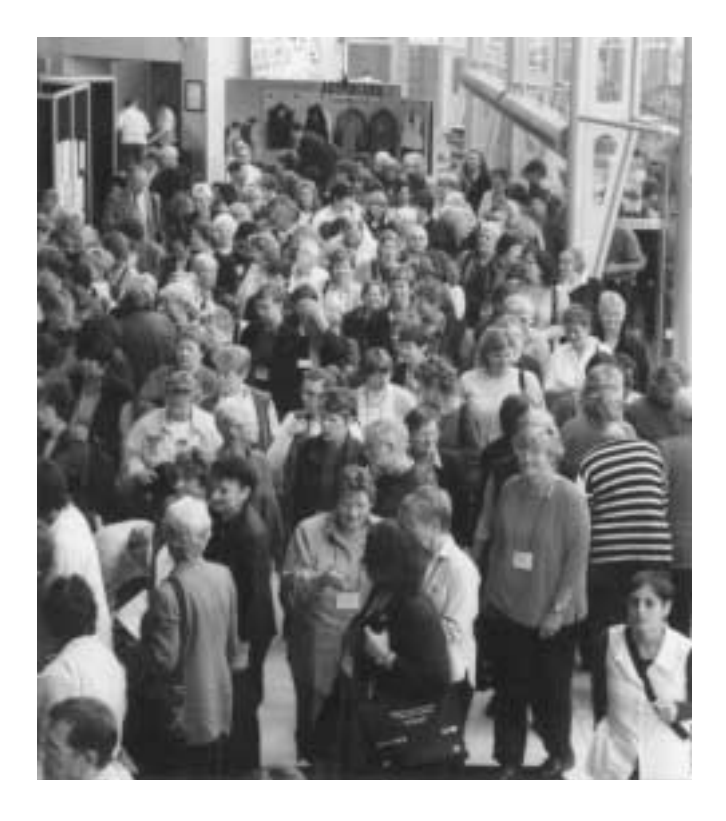
'Global perspective increased my identity within the world of dementia' PROFESSIONAL CARER FROM NEW ZEALAND

The buzz at break times was almost palpable as delegates mingled in the exhibition area continuing conversations started as they emerged from sessions. The international mix of presenters in nearly every session provided an opportunity for participants to recognise that those touched by dementia, be they a person with dementia, a family caregiver, a professional caregiver, a medical professional or a volunteer of an Alzheimer association have much more in common than difference and can learn from one another. The unique aspect of an ADI conference is that all those with an interest in dementia are brought together.