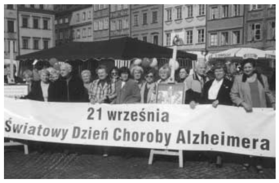
The Polish Alzheimer's Association set up an information stand in the Old Town, Warsaw. Here they distributed leaflets about receiving an early diagnosis and invited anyone over 60 to come for a free memory test