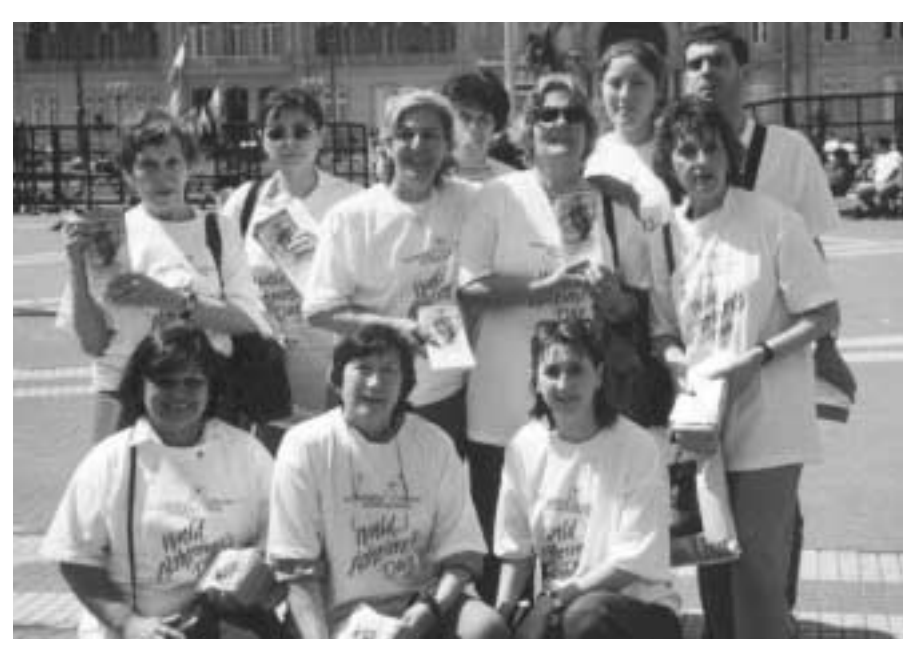
Raising awareness at Plaza de Mayo in Buenos Aires, Argentina