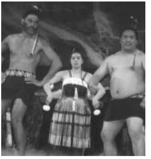
A Maori haka welcomed all delegates to New Zealand