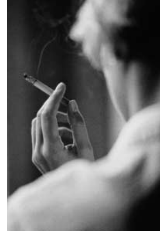
Recent studies show that smoking may increase the risk of developing dementia

Dementia occurs in about one in three people following a major stroke. Repeated smaller strokes may also cause dementia because of progressive damage to the brain. They may also bring forward the age when early symptoms of Alzheimer's disease become noticeable. People who have diseases which affect the circulation (such as high blood pressure, diabetes and heart disease) also have a higher than average chance of developing dementia. However, treatment of these conditions may substantially reduce this risk.