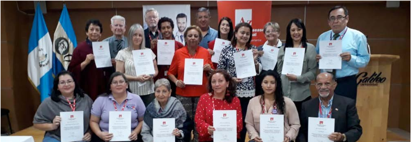
Participants of the AU in Guatemala in October

Over the past few months, ADI has organised three successful AUs: the Alzheimer University for emerging associations in London in September, the Alzheimer University on Sostenibilidad financiera para asociaciones de Alzheimer (financial stability for Alzheimer associations) in Guatemala in October, and the Alzheimer University on Advocacy & Marketing Communications in Colombo in November.