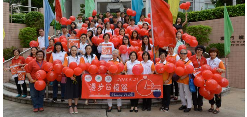
Macau Alzheimer's Disease Association's memory walk for World Alzheimer's Month

This year's World Alzheimer's Month was the biggest campaign yet, with events held in over 84 countries. The theme 'Every 3 Seconds', which was adopted by most ADI members, coincided with the ADI and ITN Productions documentary of the same name. The film is available to view on ADI's YouTube channel and features some of the inspirational work that is taking place around the world in dementia research, care and new technology. You can read more about the 2018 World Alzheimer's Month campaign, including case studies from a selection of this year's events, on our website .