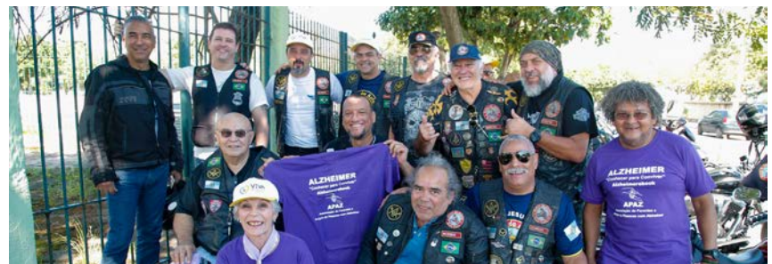
Participants of Associação de Parentes e Amigos de Pessoas com Alzheimer (APAZ)'s awareness-raising motorcycle ride in Brazil

This year's World Alzheimer's Month was the biggest campaign yet, with events held in over 84 countries. The theme 'Every 3 Seconds', which was adopted by most ADI members, coincided with the ADI and ITN Productions documentary of the same name. The film is available to view on ADI's YouTube channel and features some of the inspirational work that is taking place around the world in dementia research, care and new technology. You can read more about the 2018 World Alzheimer's Month campaign, including case studies from a selection of this year's events, on our website .