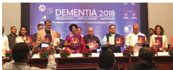
Honourable Health Minister of India, Jagat Prakash Nadda unveiling the government's national dementia strategy document

On 9 September, during the National Conference of our member, Alzheimer's & Related Disorders Society of India (ARDSI), the Minister for Health of India announced the government's commitment to a National Action Plan for Dementia, emphasising the need for quality of life to progress as longevity prospects increase. The plan, which will initially focus on risk reduction, diagnosis, care and research, could make an enormous difference to the lives of over 1.3 billion people in the country. ADI's Chief Executive Officer Paola Barbarino, who was on the panel in Bangalore when the announcement was made, described it as "an amazing feeling to take part in such a momentous occasion".