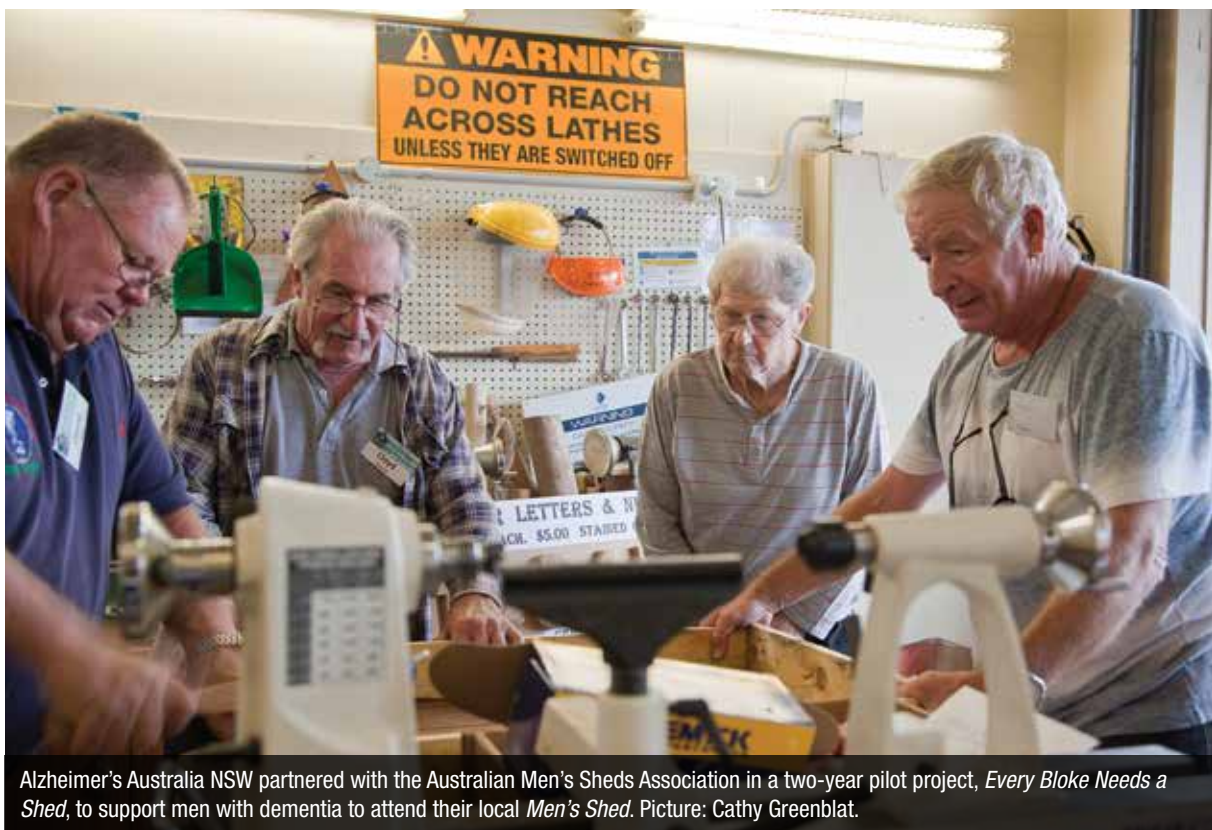
Alzheimer's Australia NSW partnered with the Australian Men's Sheds Association in a two-year pilot project, Every Bloke Needs a Shed, to support men with dementia to attend their local Men's Shed.

Alzheimer's Australia Victoria is also working with the City Council in Manningham to develop a work plan incorporating dementia friendly concepts. The project was launched by the Manningham Mayor in December 2015. This work will also inform the development of a toolkit to assist local governments and councils to embed dementia friendly principles in their strategic planning.