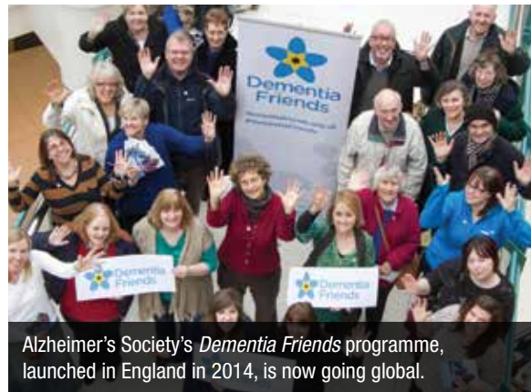
Alzheimer's Society's Dementia Friends programme, launched in England in 2014, is now going global.

Since the launch of the Prime Minister's Challenge on Dementia in 2012, England has inspired many countries around the world to embark on creating dementia-friendly communities. The Challenge placed great emphasis on the support of people affected by dementia, ensuring they could lead the lives they want within their own community. It set out commitments in three areas: driving forward improvements in health and care, better dementia research, and creating dementia friendly communities.