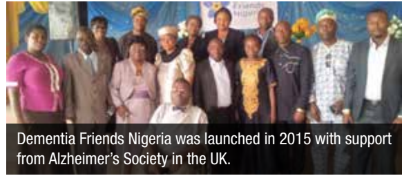
Dementia Friends Nigeria was launched in 2015 with support from Alzheimer's Society in the UK.

In September 2017, the Alzheimer's Disease Association of Nigeria (ADAN) co-hosted the 3 rd Sub-Saharan African Conference of ADI in Ibadan, attended by delegates and