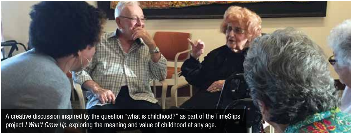
A creative discussion inspired by the question “what is childhood?” as part of the TimeSlips project I Won't Grow Up , exploring the meaning and value of childhood at any age.

Efforts to develop dementia friendly communities in the Americas have been limited, until fairly recently, to the USA and Canada. In many countries within the region awareness-raising projects run by Alzheimer associations are still the main focus as a response to a lack of diagnosis and recognition as well as stigma, while multi-sector approaches are still much less common. However, with an increased focus on improving or developing dementia policy in Latin America and the Caribbean, there are signs within some countries that the concept of dementia friendly is beginning to gather interest.