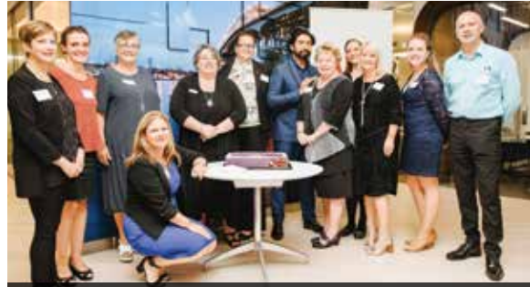
Representatives of Alzheimer’s New Zealand meet with Westpac Bank, awarded dementia friendly status as part of the Dementia-friendly Recognition Programme in 2017

In 2015, Alzheimers New Zealand (Alzheimers NZ) adopted a new strategy and a new mission supporting people living with dementia to live well in their communities. This strategy and mission is shared with its Members, local Alzheimer organisations that provide frontline services in communities around the country. The Strategy and Mission reflect Alzheimers New Zealand’s commitment to achieving a dementia-friendly New Zealand – a New Zealand where people living with dementia are valued, where they can contribute to and participate in their communities, where they receive the support and services they need to live well, and where they feel safe.