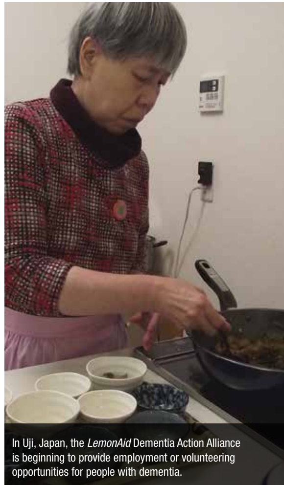
In Uji, Japan, the LemonAid Dementia Action Alliance is beginning to provide employment or volunteering opportunities for people with dementia.

Japan's approach to creating dementia friendly communities has provided inspiration worldwide for its innovation, involvement of people with