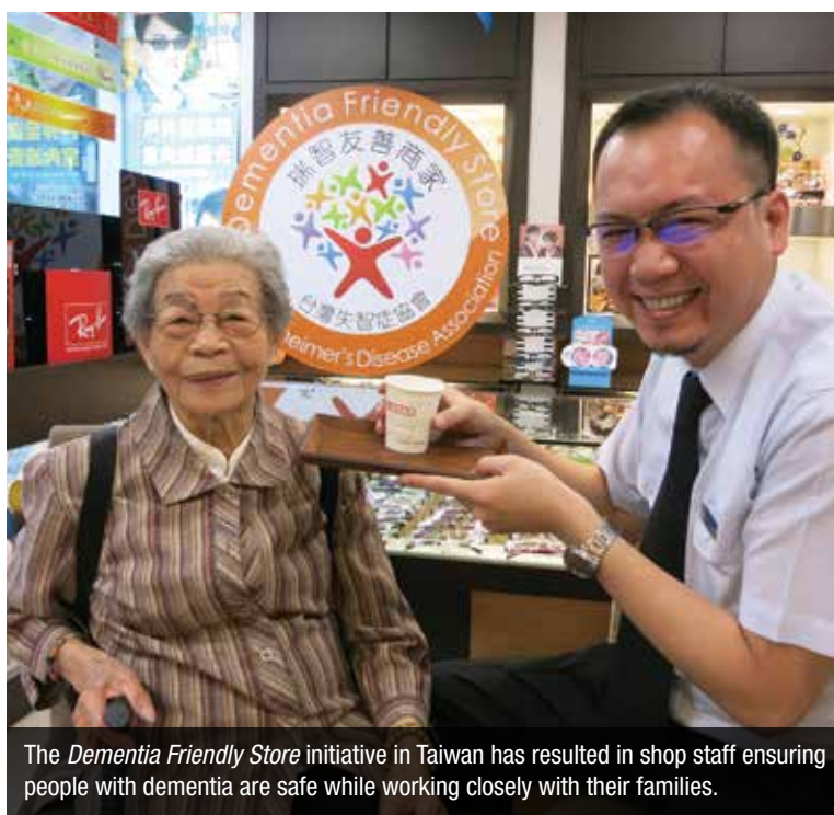
The Dementia Friendly Store initiative in Taiwan has resulted in shop staff ensuring people with dementia are safe while working closely with their families.

The decision taken by TADA to develop separate projects for each sector was consciously made to enable groups, service providers or organisations to have their own dementia friendly title, which was believed to be more appealing than an umbrella term. The government of the County of Miaoli are supporting the development of dementia friendly communities in the area with local adoption of TADA's Dementia Friendly Organization and Dementia Friendly Clinic programmes. In addition, the Elderly with Dementia Guardian Angel Project is being run locally to educate the public about dementia and inform members of the community about how they can become a Guardian Angel. The project aims to keep people with dementia at home and active in the community for as long as possible.