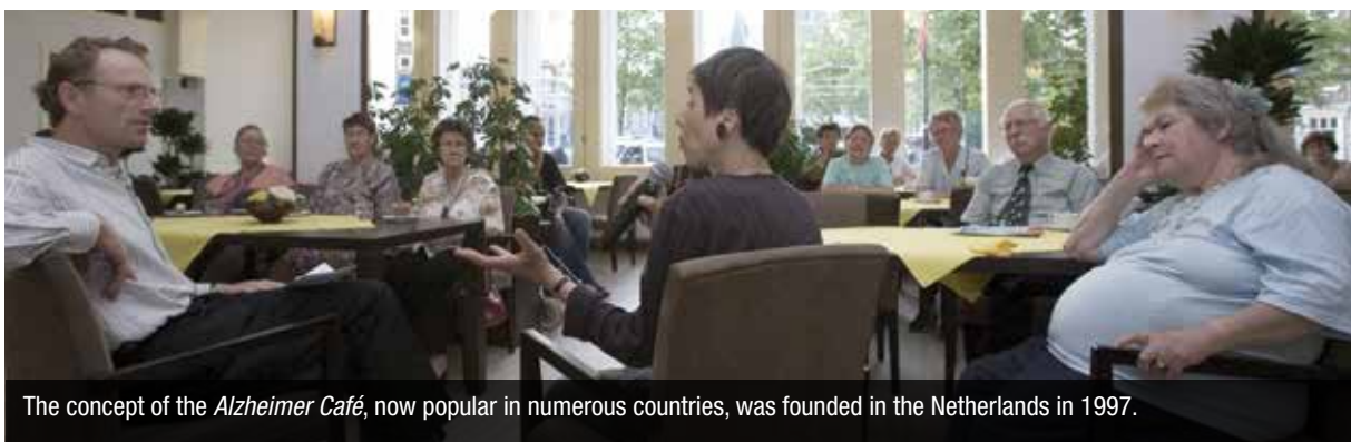
The concept of the Alzheimer Café , now popular in numerous countries, was founded in the Netherlands in 1997.

Prior to the introduction of the Delta Plan Dementia’s programme, in September 2015,