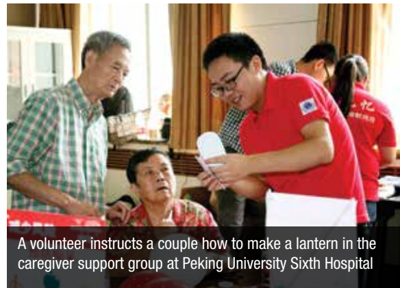
A volunteer instructs a couple how to make a lantern in the caregiver support group at Peking University Sixth Hospital