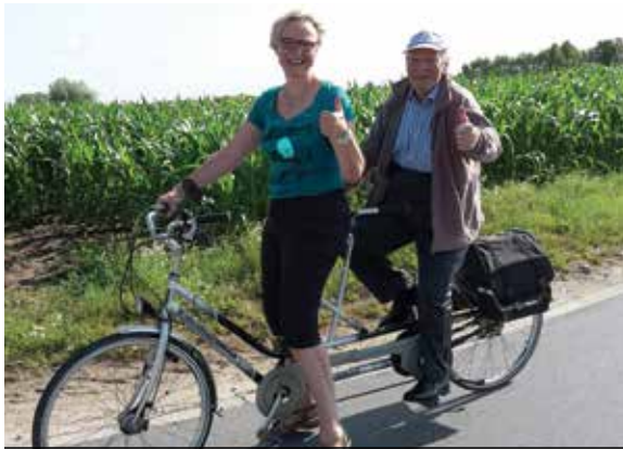
One of the aims of Together for a dementia friendly Bruges! is to highlight and support the abilities of the people with dementia.

respite service. The Charter also requires cities to appoint a “Proxiedem Agent” to meet, inform and guide people with dementia and carers within the city. To date, 32 cities have signed the Charter and are working to become more dementia friendly.