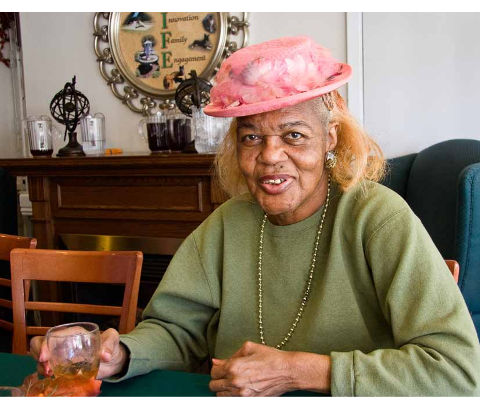
Six women at this Silverado Senior Living residential Alzheimer's community in Texas, USA, were taken by staff members to a flea market to select and purchase a hat. The next day a special table was set for them in the dining room. Each woman arrived, sporting her new hat or was helped to put it on. They all had a good time.

The effectiveness of health systems in identifying people with dementia depends upon the potential consumers, as well as the providers of health and social care. Encouraging help-seeking by raising awareness of dementia is an essential component of any comprehensive strategy to close the treatment gap. However, increased demand needs to be met by adequately prepared and resourced services, trained and able to make accurate diagnoses in a timely and efficient manner, and to ensure that the diagnosis leads seamlessly to the provision of evidence-based care. While acknowledging the importance of promoting demand for services, the focus for this chapter is upon service responses.