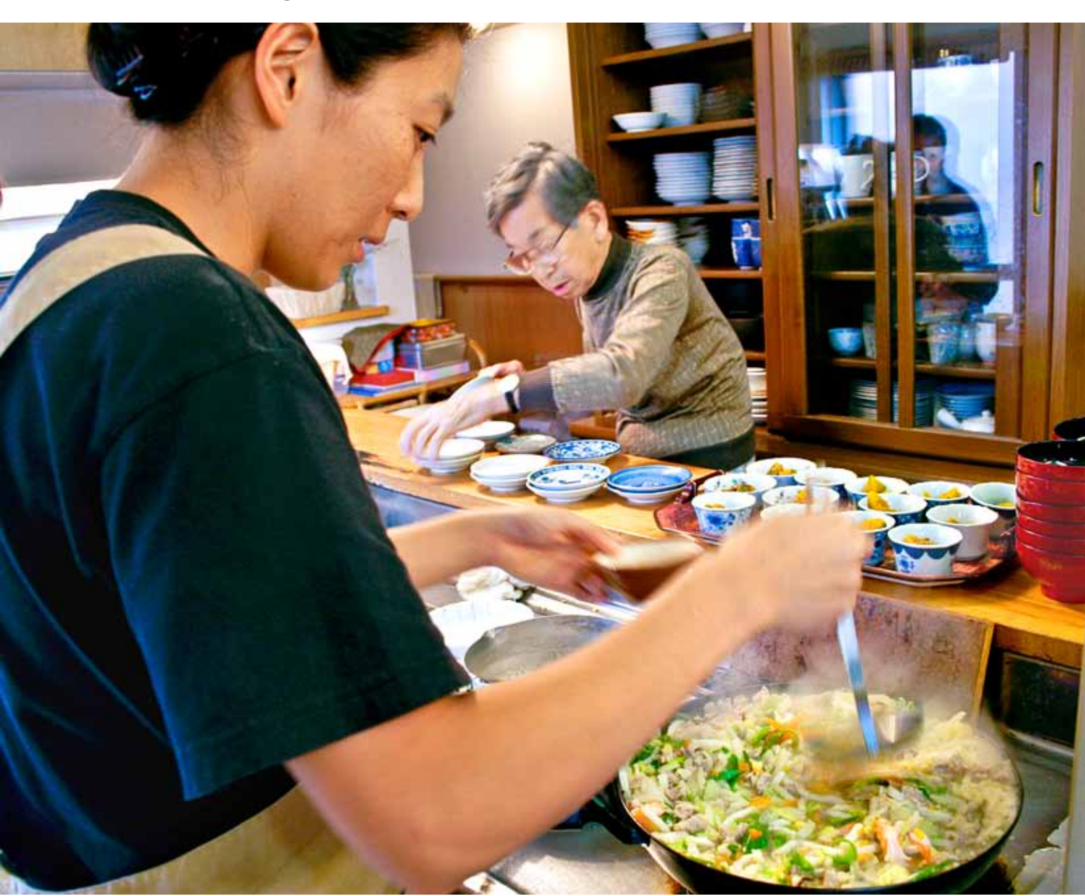
Since there are only nine residents in most of the Japanese group homes, there is no institutional cooking. Preparation of meals is done by the staff, with assistance from some of the residents who are able to help and wish to do so. At this group home in Kyoto, everyone did something to participate, whether it was laying out the plates and chopsticks or checking on all the dishes to be served, as was the case of the man here, a former chef.

The economic costs of dementia are enormous. In last year's World Alzheimer Report, we estimated that worldwide costs were US$604 billion per year in 2010<sup>(42)</sup>. These 'societal' costs included the costs of unpaid care provided by family members and others (sometimes referred to as indirect costs), the direct costs of medical care and the direct costs of social care provided by community services, residential care homes and nursing homes.